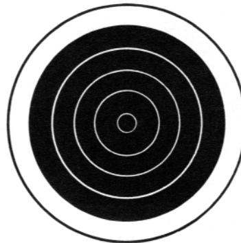
50 ft. indoor target (actual size)